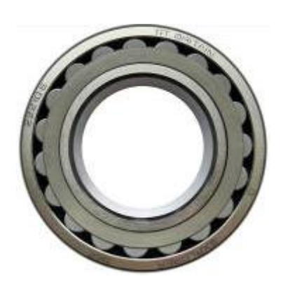
Overview of the complete product