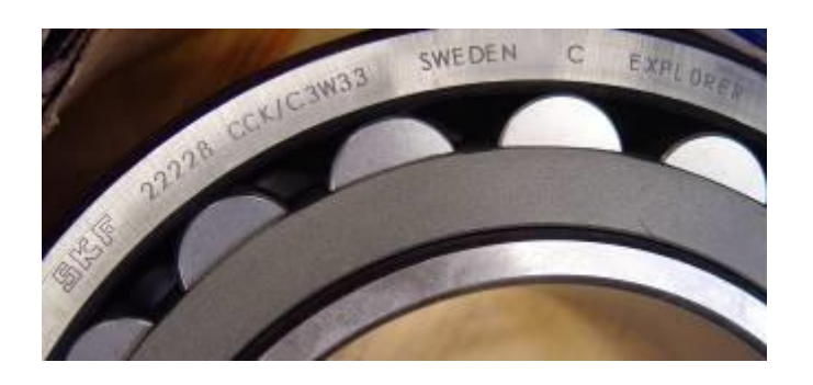
Close-up on all product markings (Take several photos to capture all markings if necessary)

Send all information and photos to genuine@skf.com