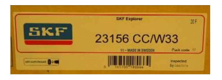
Labels, barcode, and other markings if any visible